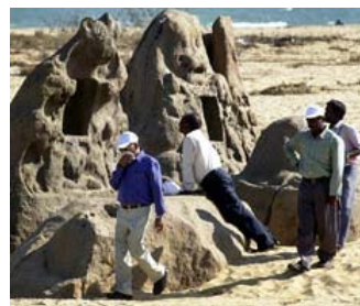
Archeologists investigate an ancient artifact uncovered by the tsunami at Mahabalipuram, India.

The rocky structures have generated much excitement and hopeful expectations about what may be revealed next. Both Archeologists and the Indian Navy are getting