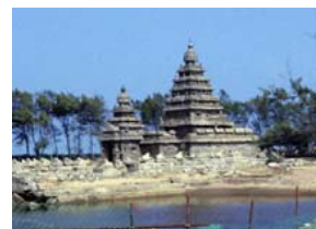
The Shore Temple in the ancient city of Mahabalipuram, India.

Pisces in the 2nd it shows something of great spiritual value. This was uncovered Dec 30, 2004. If we progress the Tsunami Quake chart (pg 5 of January issue) by moving the MC a degree for a day, in 4 days the MC would have reached 00 degrees of Scorpio, conjunct the South Node of the chart. This is something from the past (SN) brought out to the world (MC) of deep meaning, (Scorpio) With Pluto in Sagittarius on the world radar we have many new/old philosophical truths coming to the surface to be examined.